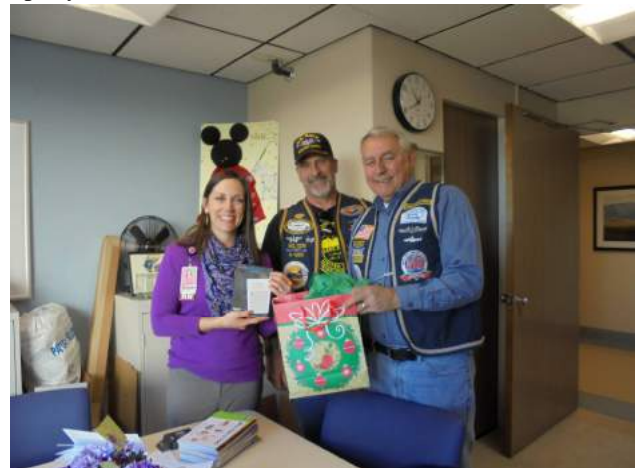
St Mary's Christmas Gift